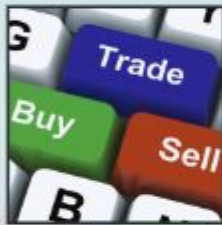
Associations & Chambers