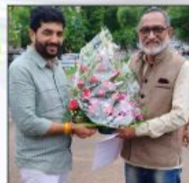
Shri Murlidhar Mohol, Union Minister & Trinity Chairman