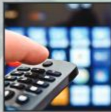
TV & Cable Channels