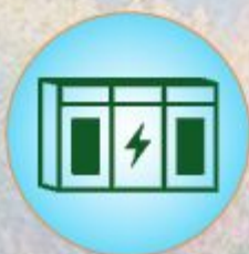
Battery & ESS