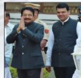
H. E. Governor Rao & CM Fadnavis of Maharashtra