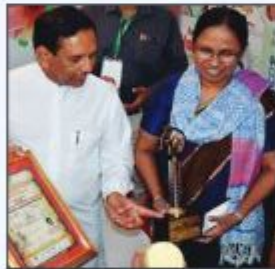
Sri Lankan Minister & Kerala Health Minister