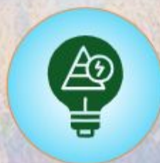
LED & Light