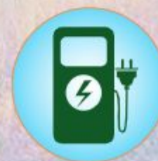
EV & Mobility