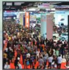
In Venue Displays