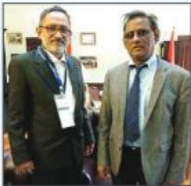
President of Mauritius & CMD of Impex Chamber