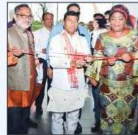
India's Minister R Teli & Congo Ambassador