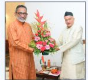
Governor of Maharashtra & Impex Chamber MD