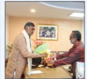
India's Minister PS Patel presented floral tributes