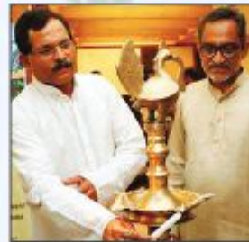
India's Minister Shripad Naik lighting the traditional lamp